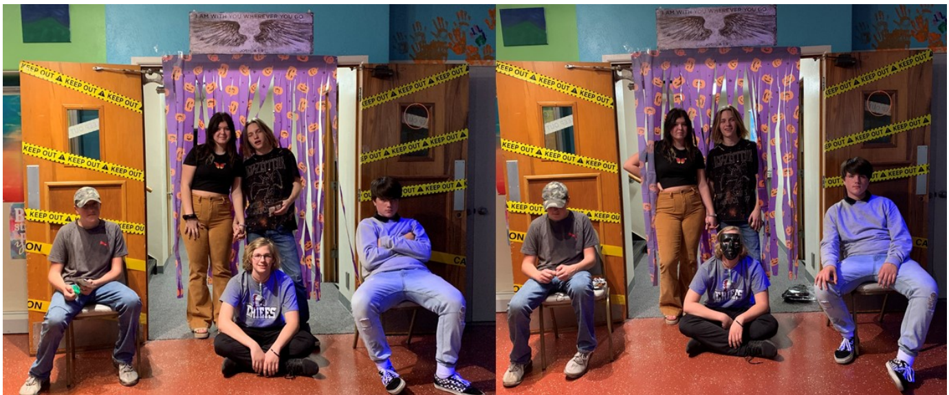
Let's play spot the differences!