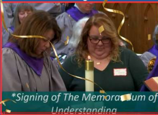
*Signing of The Memorandum of Understanding